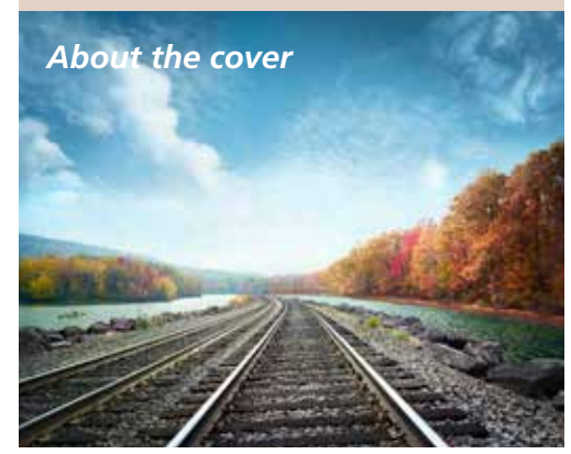
Amtrak has added additional service to conveniently take you to and from your holiday destinations. Embrace the colorful season through the windows of the Acela Express and Northeast Regional trains.

On Acela Express®, Northeast Regional<sup>sM</sup>, Keystone Service® and Empire Service® trains, the heaviest travel days will be Wednesday, November 22 and Sunday, November 26. The highest customer volumes will be present in stations and aboard trains on those two days, and reduced Amtrak fares will generally not be available. Friday, November 24, is likely to be the least crowded travel day on trains and in stations. Keystone Service trains, which normally do not require reservations for travel between Philadelphia and Harrisburg, will require reservations November 21-27.