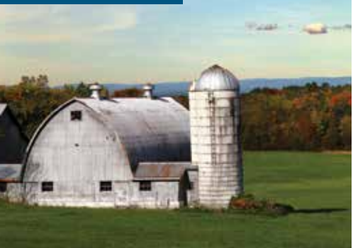
Amtrak has added additional service to conveniently take you to and from your holiday destinations. Scenes like this pastoral moment captured by Amtrak Exhibit Train Trainmaster, Steven K. Ostrowski, is an example of views one might see from our panoramic train windows.

Schedules subject to change without notice. Amtrak is a registered service mark of the National Railroad Passenger Corporation, 60 Massachusetts Avenue, NE, Washington, DC 20002. NRPC Form T-5–Internet Only–11/23/15